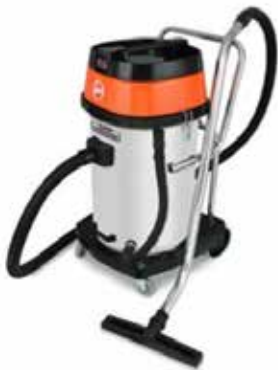
Commercial Wet/Dry Vac