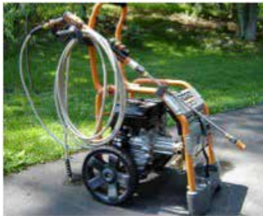
Gasoline-Powered Pressure Washer