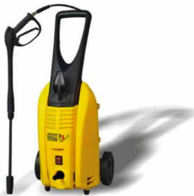
Electric Pressure Washer