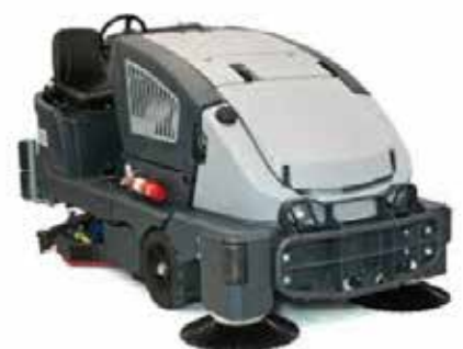
Manual Ride-On Scrubber