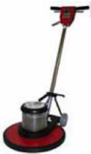
Low Speed Floor Buffer

A floor buffer machine is designed to clean surfaces including hard natural stone tiles and pavers. Rotary brushes pick up dirt from a surface, leaving a glossy, polished finish on the floor. The buffer machine consists of a handle which is connected to a horizontally rotating head. Beneath the head a large circular scrubbing pad is attached. The scrubbing pad spins in one direction and is usually electric, battery or propane powered. The type of power source will determine the maximum speed the pad can rotate and what cleaning process can be achieved. Some floor buffers contain a tank for solutions. Cleaning solution can be directly dispensed from the tank into the scrubbing pad and onto the floor. NOTE if Oxy-Klenza™ is being applied ensure that the solution tank is stainless steel or plastic as iron and other metals will be corroded by Oxy-Klenza™ because it is an oxidiser.