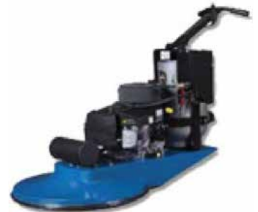
High Speed Floor Buffers