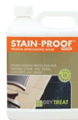
Dry-Treat™ STAIN-PROOF™ Original