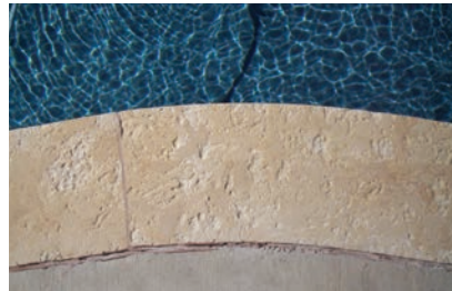
Salt spalling on travertine around a saltwater pool